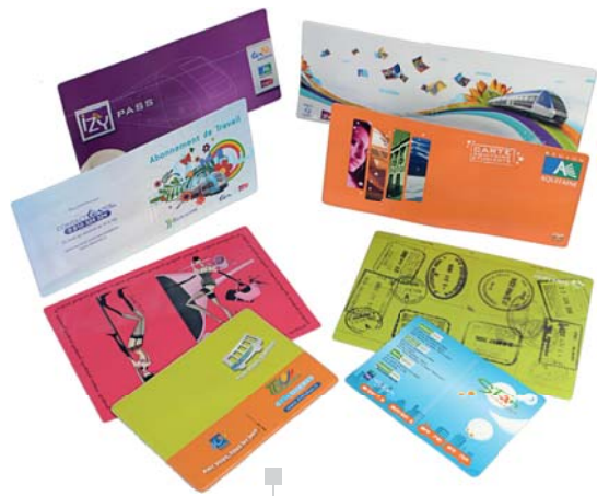
Document and card-holders